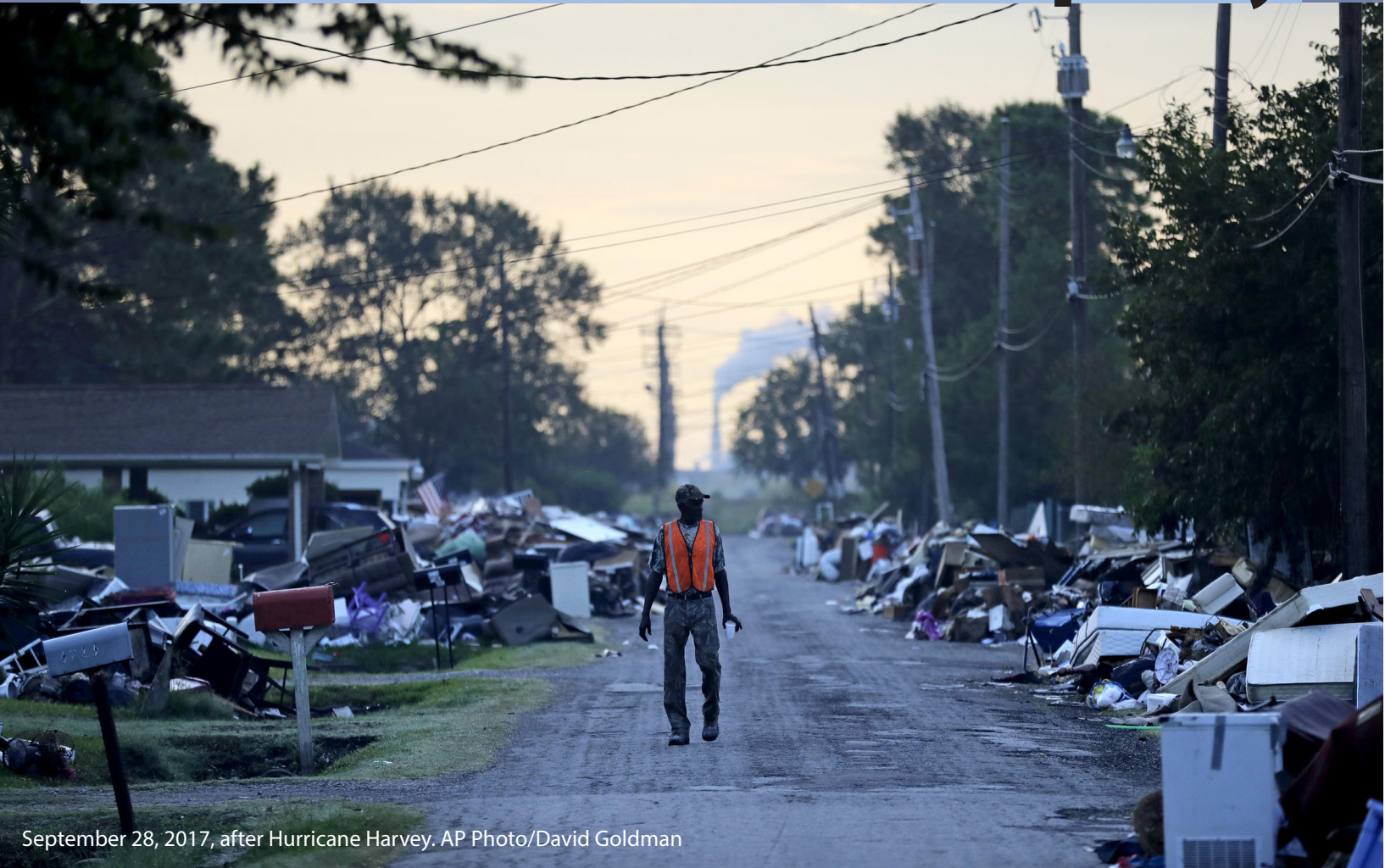
September 28, 2017, after Hurricane Harvey.